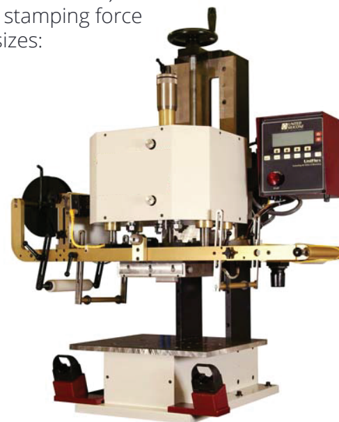
Model US 25