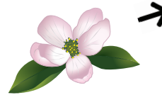
Resized Vector Graphic

Fonts can get complicated. If the font you are using for your image is not a common font, the chances that we will have a match is slim. It is good practice when sending a design to change fonts into shapes by using a 'create outlines' function. To the left is often how selected word looks in both an outlined and non-outlined format. Another option is to send the font package to us or save the image in .pdf format for us so we can use a work-around process to outline the fonts ourselves.