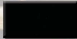
EB1008AC-50 Gloss Black