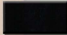
EB1003AC-50 Matte Black