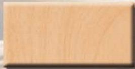
EB2427AC-50 Fusion Maple