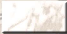
EB3609AC-50 White Marble Custom