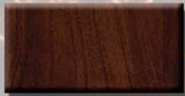
EB4246TG-50 Cracked Cherry