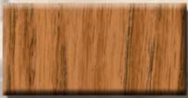
EB3175AP Woodland Oak Custom