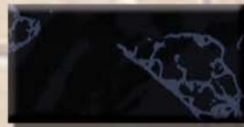
EB2633AC-50 Black Marble