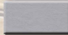
EB2900AC Satin Silver Custom