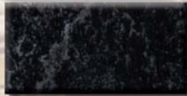
EB3604AC-50 Black Canyon Marble