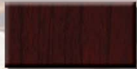
EB3218AC-50 Classic Cherry