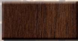
EB2010TG Dark Walnut